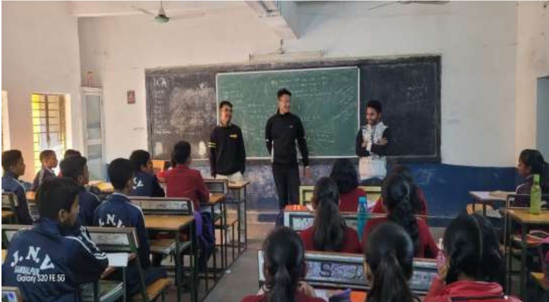
Skill class and exposures