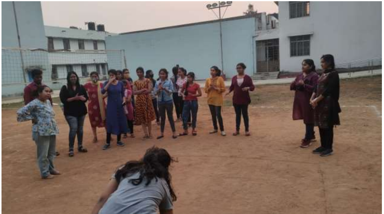
ROLE PLAY AND VOICE MODULATIONS