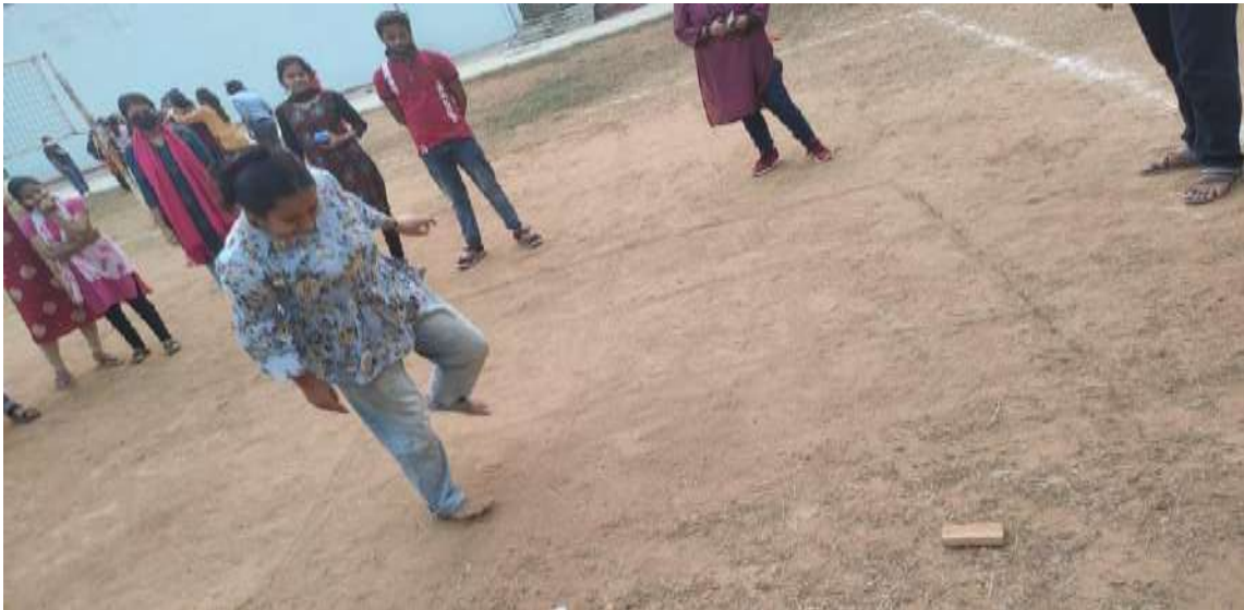
Social science play school