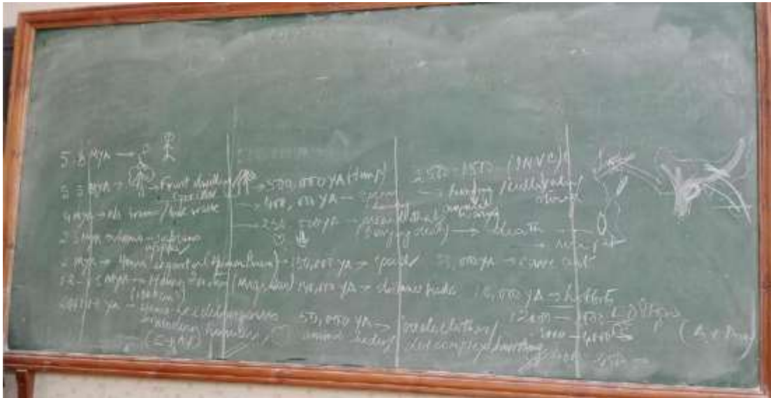
Skill Class and Black Board Writing