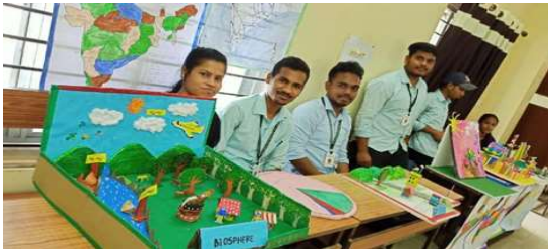
Making Resources from waste material