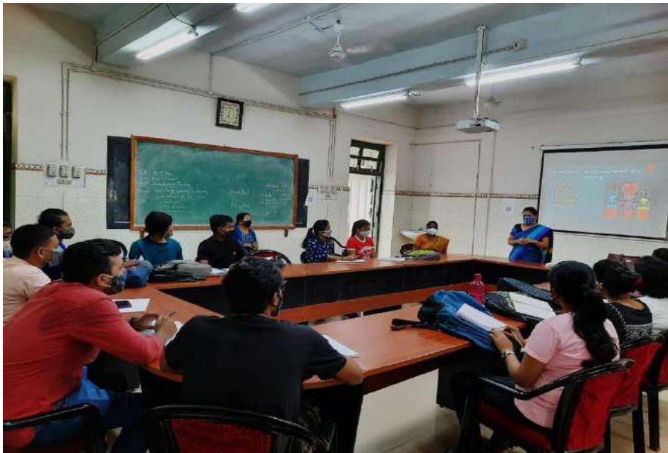
Using Smart Board and Black Board together